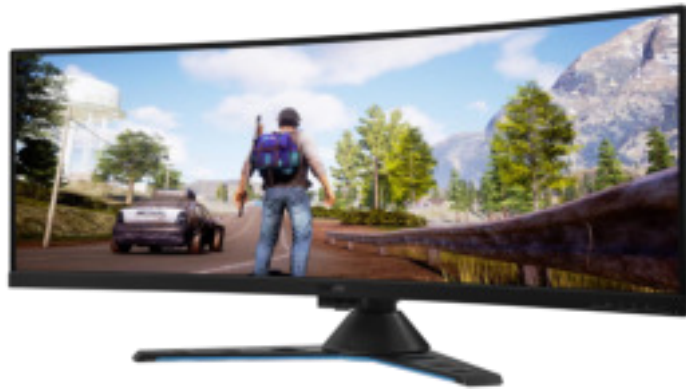
FreeSync2 32:10 Y44w-10