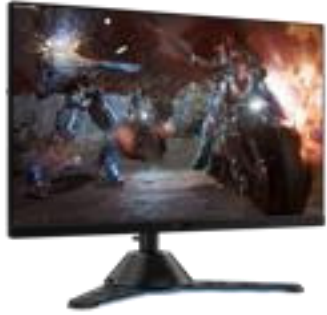
FreeSync QHD Y27q-20