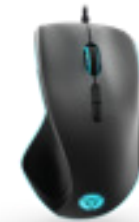
M500 Gaming Mouse