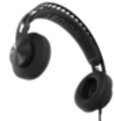
H500 Gaming Headset