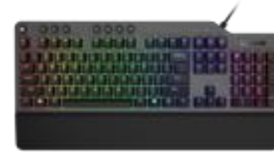
K500 Gaming Keyboard