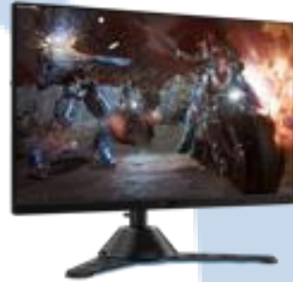
G-SYNC QHD Y27gq-25